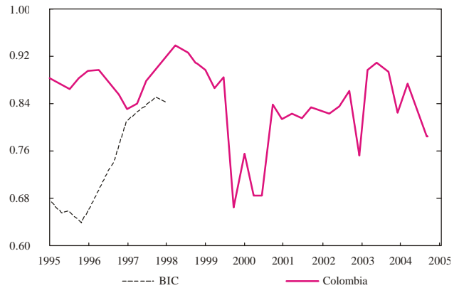
LEVELS OF EFFICIENCY BY THE BANCO DE COLOMBIA